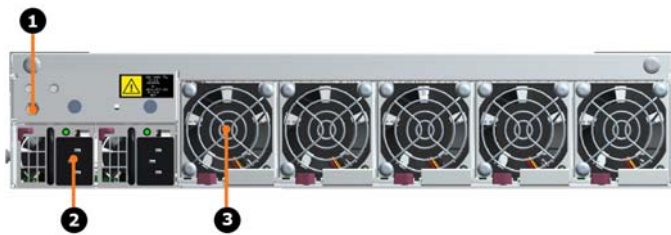
Figure 3. TippingPoint IPS NX-Platform device - back panel