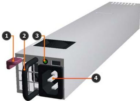
Figure 1. TippingPoint AC power supply module