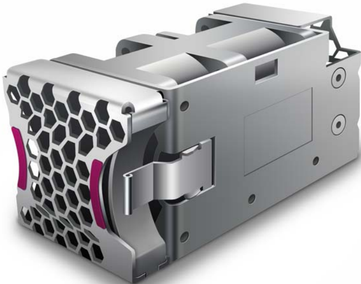
Figure 1. TX Series device - fan module

The TPS TX Series devices include seven hot-swappable fan modules.