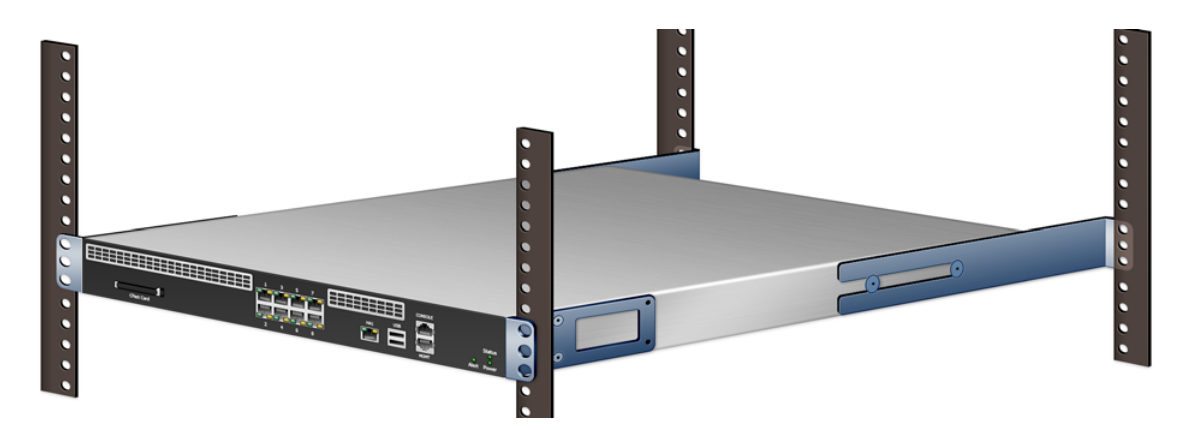
Figure 1-4 1U chassis in a four-post rack