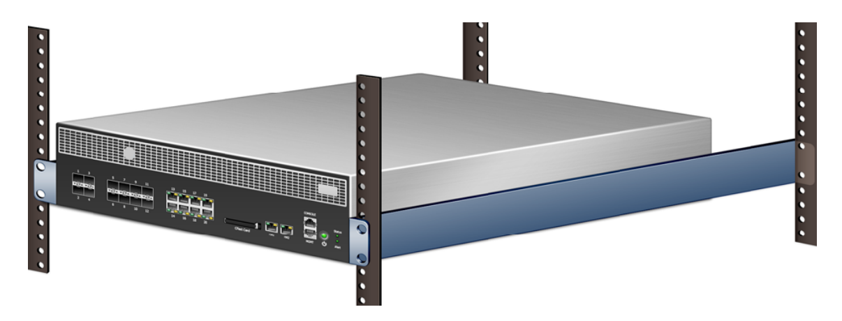
Figure 1-8 2U chassis in a four-post rack

Use Figure 1-8 as a reference for how a 2U chassis is installed in a four-post rack with slide rails.