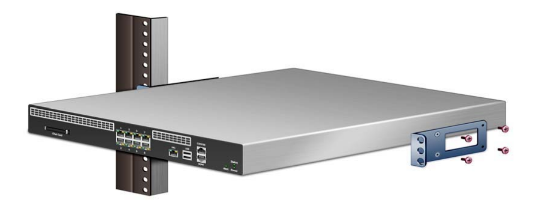
Figure 1-3 Mid-mounting a 1U chassis in a two-post rack