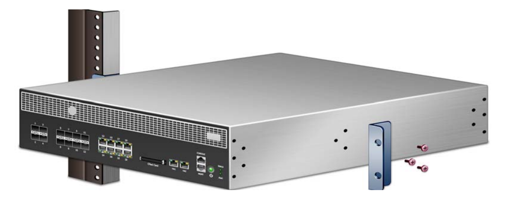
Figure 1-7 2U chassis with mid-mounting in a two-post rack