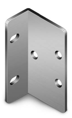
Figure 1-5 2U chassis front-mount bracket and ear

2. Secure the brackets to the chassis using the flat-head screws (three on each side) that came with the kit.