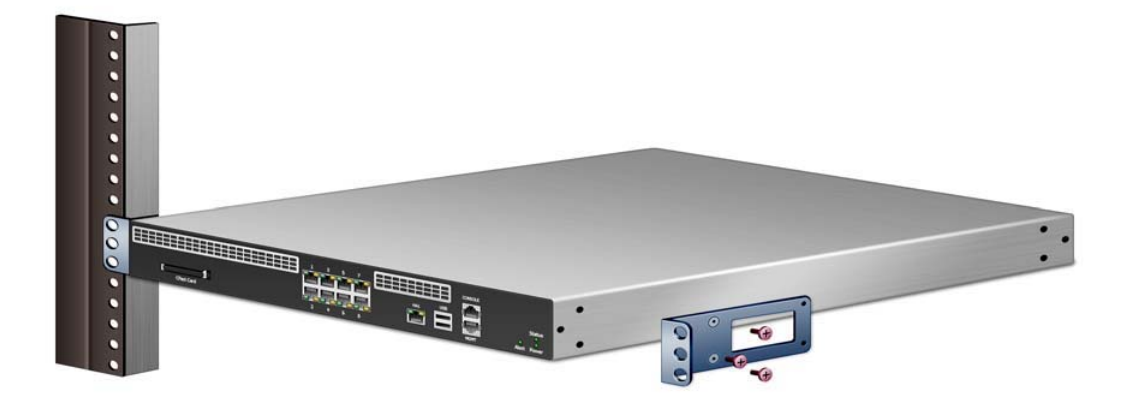
Figure 1-2 Front mounting a 1U chassis in a two-post rack

2. Secure the rack-mounting brackets into the holes of the front rack post or mid-rack post with three screws on each side (rack screws not included in the kit). Use Figure 1-2 as a guide for how the front rack-mounting brackets are attached to the device and to the rack in a front-mount. Use Figure 1-3 as a guide for how the front rack-mounting brackets are attached to the device and to the rack in a mid-mount.