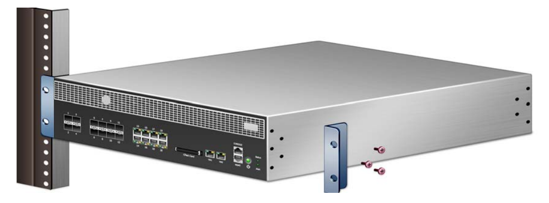
Figure 1-6 2U chassis with front mounting in a two-post rack

Use Figure 1-6 as a guide for how the front rack-mounting brackets are attached to the appliance and to the rack in a front mount. Use Figure 1-7 as a guide for how the front rack-mounting brackets are attached to the appliance and to the rack in a mid-mount.