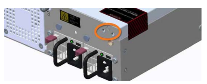
Figure 1-4 2200T DC grounding screw holes to accept the lug connector attached to ground

The power supply LED is green when the module is powered and running normally.