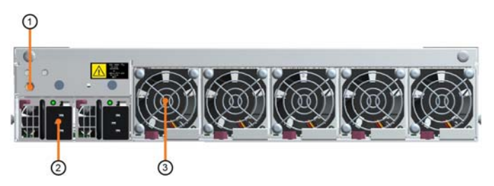
Figure 1-1 TippingPoint NX-Platform device - back panel