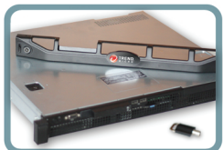
Device with bezel

Your package should include the following items: