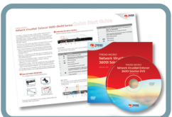
Documents & DVD-Rom

If there are any items missing in your package, please contact your Trend Micro sales representative.